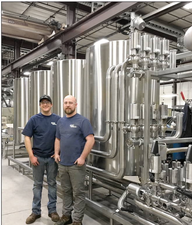
Custom quad tank CIP system