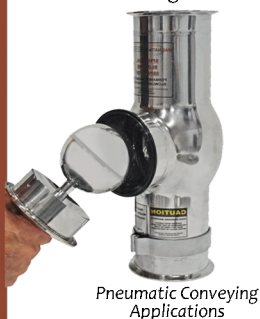
Pneumatic Conveying Applications