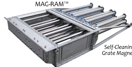
Self-Cleaning Grate Magnet